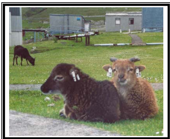
Soay lambs at rest

Our spring expedition (March – May) conducted standard censuses of the sheep living in Village Bay and of the Village Bay vegetation communities. 217 lambs were born to Village Bay ewes of which 148 were caught, weighed, sampled and tagged, and 22 died of natural causes before tagging.