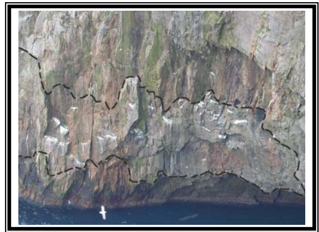
A cliff plot on Hirta

Counts were made of razorbills, guillemots and fulmars in 25 sub-sections of cliff ('plots') around Hirta. Plots are defined by natural features such as cracks, and vegetation patches (as shown below) and are standardised so that counts can be compared between years.