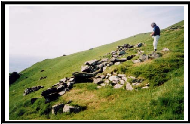
Archaeological monitoring work on Boreray

This annual newsletter is intended to inform non-specialists of the varied research projects which are being carried out on St Kilda. It does not include reports on the day-to-day monitoring work of NTS staff based on the archipelago, which is varied and time-consuming. For example, cetacean and migrant bird records are kept, upstanding structures are monitored for decay, coastal erosion is monitored across Village Bay and the change in extent of bracken is recorded across the crofts. This work is reported in the annual reports produced by the St Kilda Ranger and St Kilda Archaeologist (see contact details below).