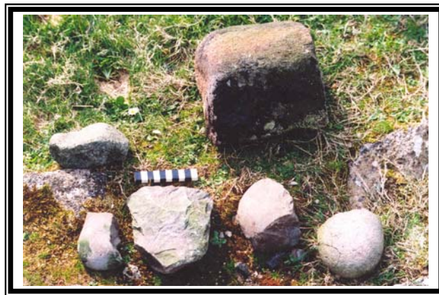
A typical group of stone tools found during the repair of a drystone structure

There are other interesting stones in the standing structures of Village Bay, and Andrew has returned to study them. Many stones, mostly dolerite, have been brought up from the beach and used without further modification ('manuports').