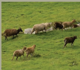
Soay sheep