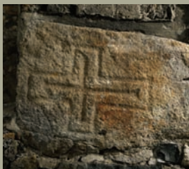
Early Christian cross