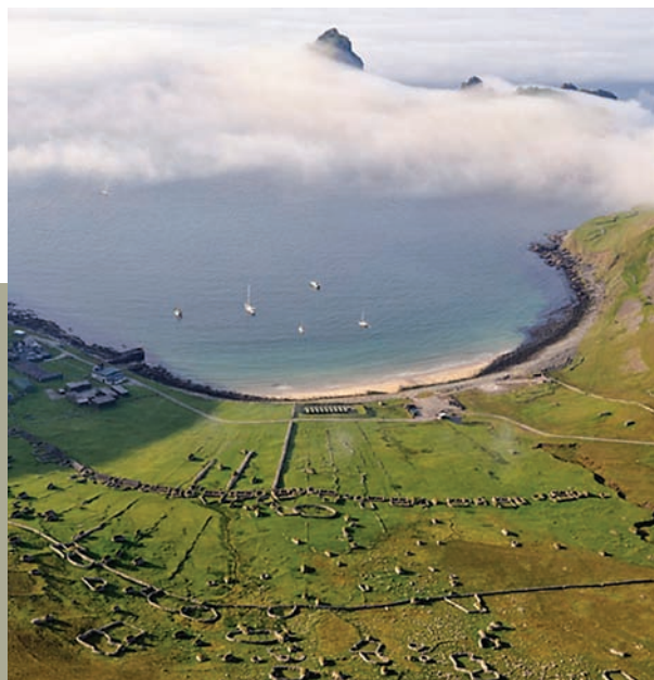
Village Bay

In July 2005, St Kilda became one of a few World Heritage Sites to hold dual status for both its natural and cultural qualities.