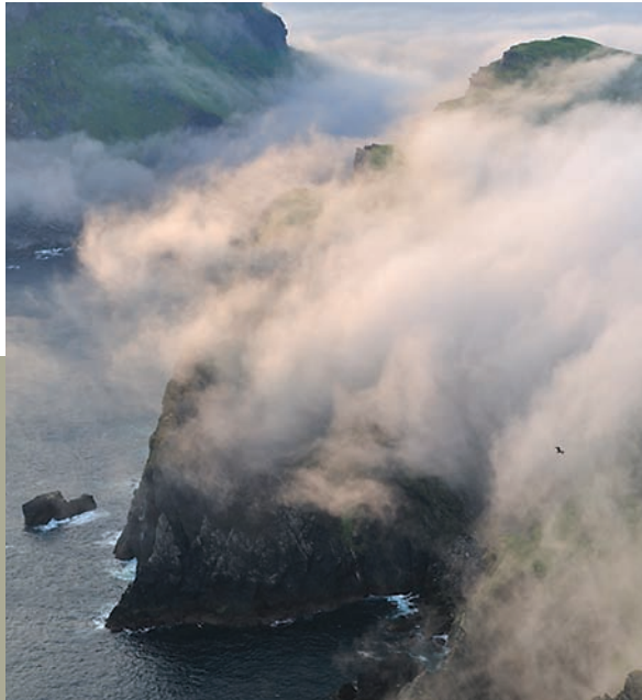
St Kilda

Front cover: Cleit above Village Bay. Fulmar and Thrift. Islanders